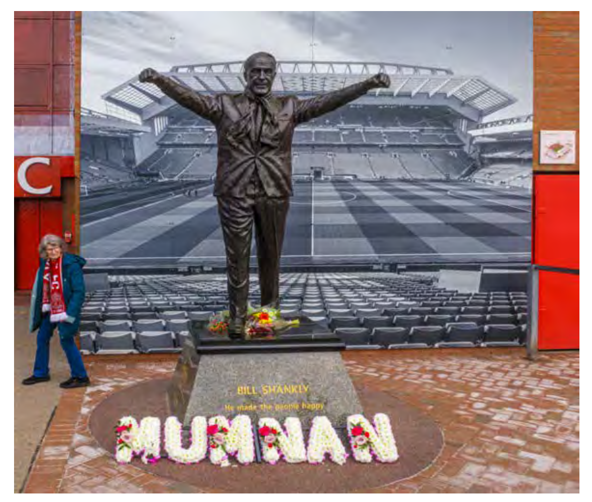
He made the people happy