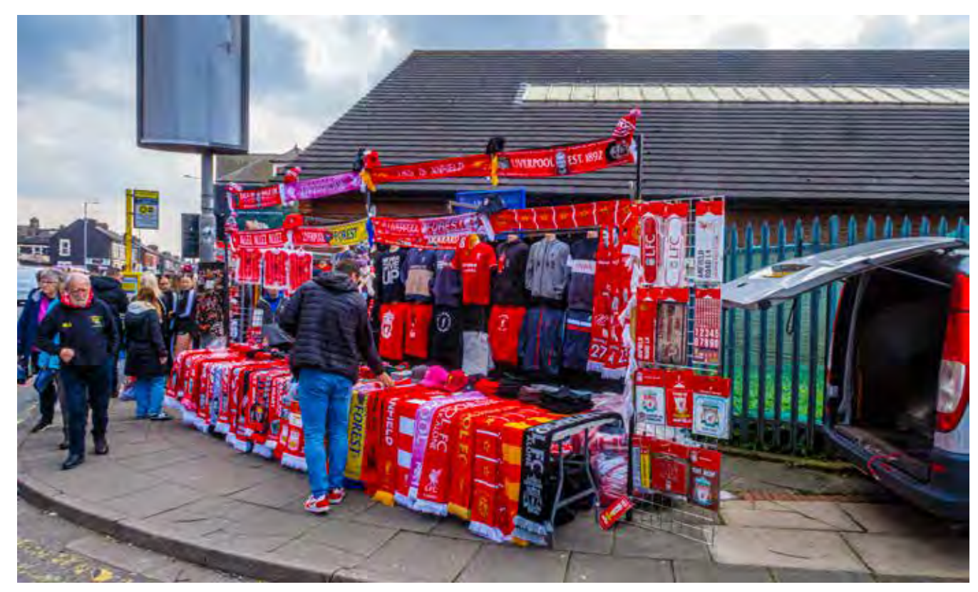
Scarves for sale