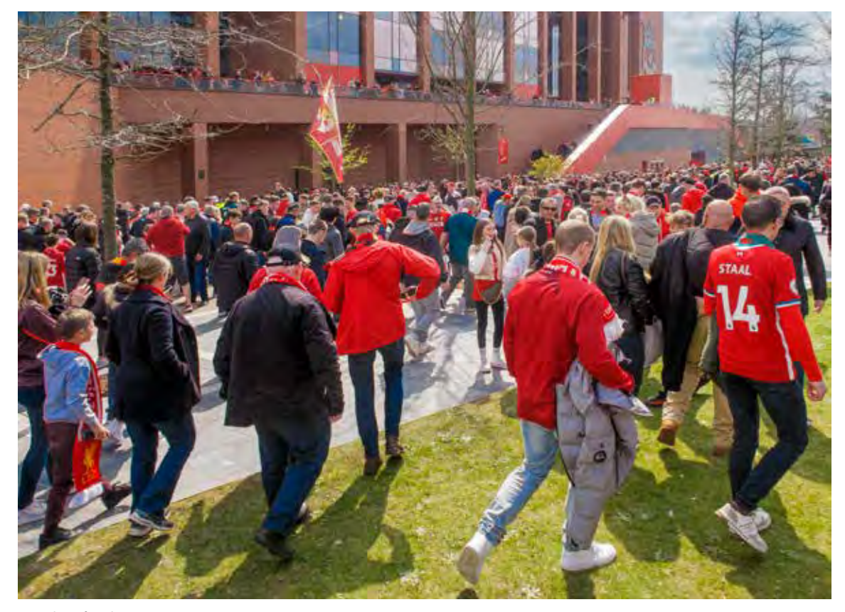
Heading for the entrances